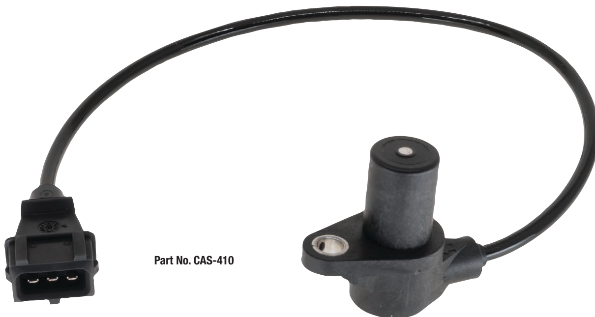
Part No. CAS-410