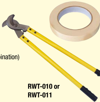
RWT-010 or RWT-011