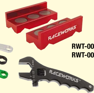
RWT-002 or RWT-003